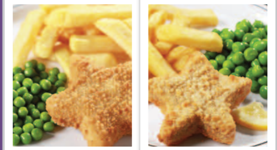
Salmon/Cod Fish Star (MSC) served with Chips & Peas or Baked Beans

VEGETARIAN VERSIONS OF THE ABOVE MEAL AVAILABLE DAILY