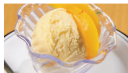
Ice Cream & Fruit