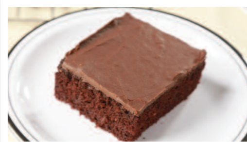
Iced Wacky Chocolate Cake