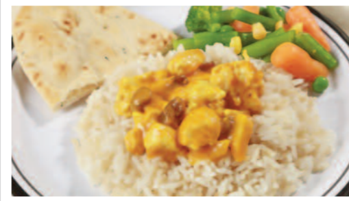
Fruity Chicken Curry served with Rice, Naan Bread & Seasonal Vegetables