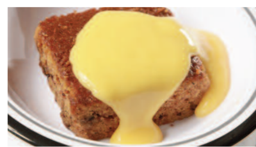
Sticky Toffee Pudding served with Custard