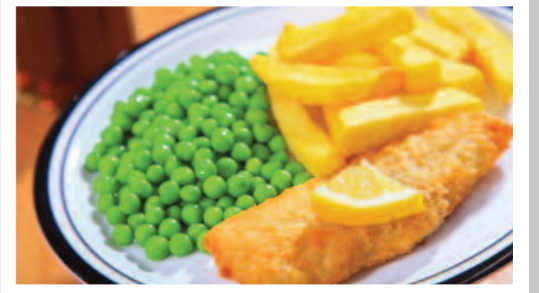
Battered Fish (MSC) served with Chips & Peas or Baked Beans

VEGETARIAN VERSIONS OF THE ABOVE MEAL AVAILABLE DAILY