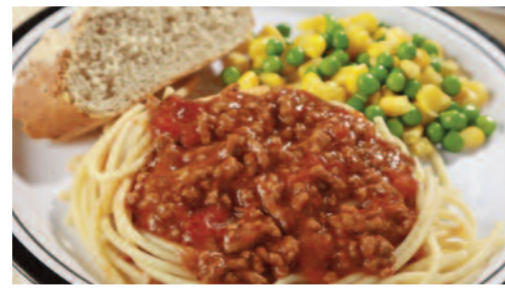
Spaghetti Bolognese served with Garlic & Herb Bread and Seasonal Vegetables