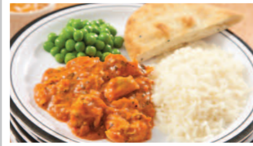
Chicken Tikka Masala served with Rice, Naan Bread & Seasonal Vegetables