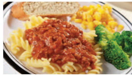
Pasta Bolognese served with Garlic & Herb Bread and Seasonal Vegetables