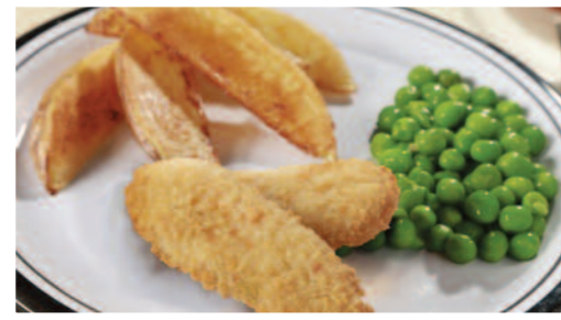
Breaded Chicken Goujons served with Potato Wedges & Seasonal Vegetables