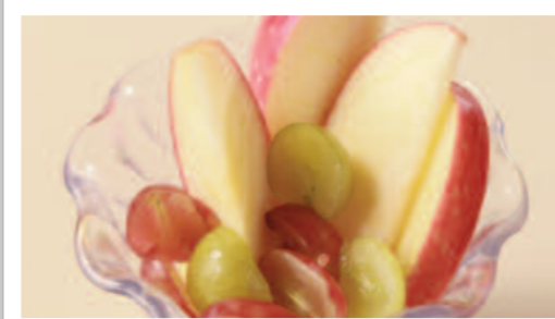
Apple & Grape Pot