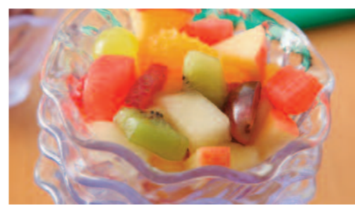
Fresh Fruit Salad