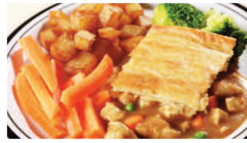
Homemade Chicken Pie served with Diced Crispy Potatoes & Seasonal Vegetables