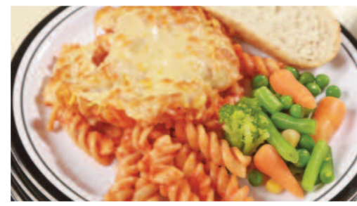
3 Cheese & Tomato Pasta served with Garlic & Herb Bread and Seasonal Vegetables