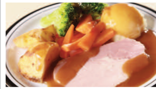
Honey Roast Gammon served with Roast/Mashed Potatoes, Seasonal Vegetables & Gravy