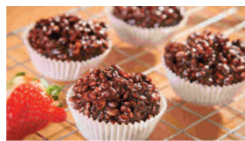
Chocolate Crispy Cake