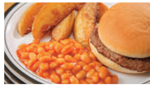
Beef Burger served in a Bun with Potato Wedges & Seasonal Vegetables or Baked Beans