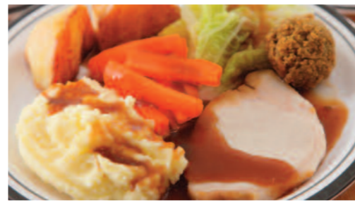
Roast Pork served with Roast/Mashed Potatoes, Seasonal Vegetables & Gravy