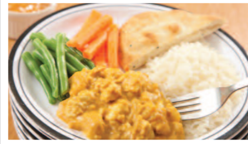
Chicken Korma served with Rice, Naan Bread & Seasonal Vegetables