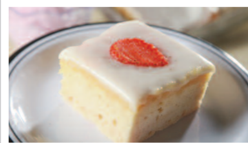
Strawberry Ice Cream Cake