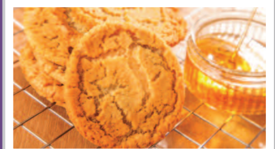
Golden Crunch Cookie

AVAILABLE DAILY – UNLIMITED SALAD, FRESHLY BAKED BREAD, FRUIT YOGHURT, FRESH FRUIT PLATTER & CHILLED WATER. FOR ALLERGEN INFORMATION, PLEASE ASK ONE OF OUR CATERING TEAM. ALL THE ABOVE DISHES ARE SUBJECT TO AVAILABILITY.