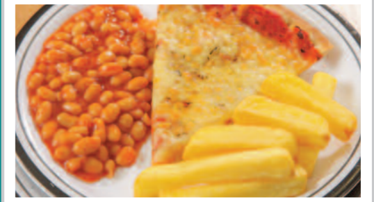
Cheese & Tomato Pizza served with Chips & Peas or Baked Beans

VEGETARIAN VERSIONS OF THE ABOVE MEAL AVAILABLE DAILY